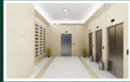
DESIGNER LIFT LOBBY