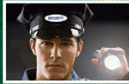
24x7 SECURITY GUARD